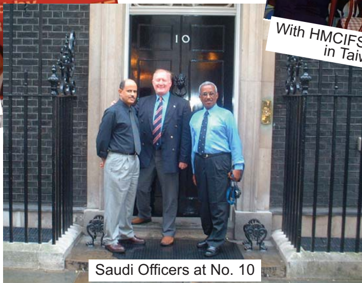
Saudi Officers at No. 10