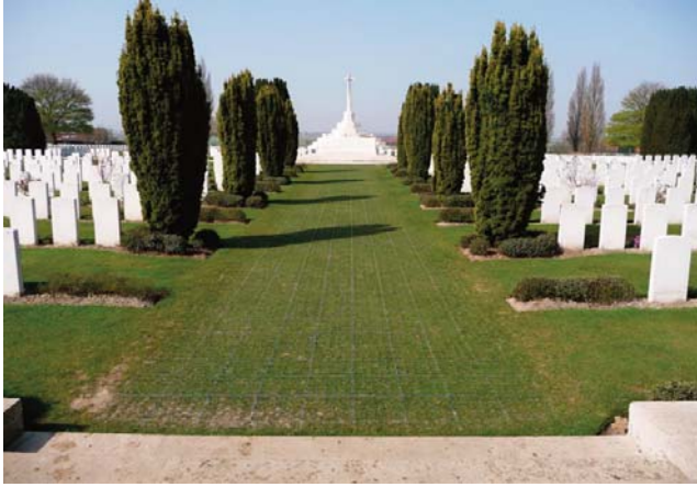
The British Cemetery at Tyne Cot